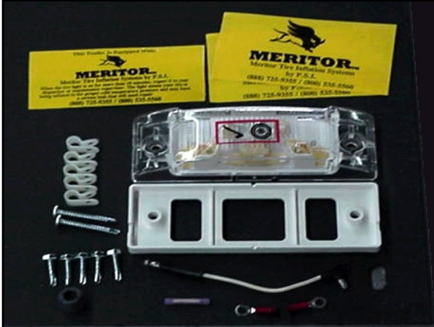
31263-06 Light & Bracket Assy