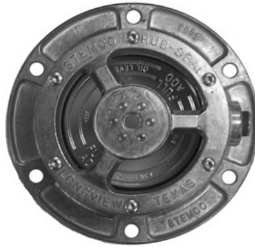
343 4350 Oil 6 Hole Hub Cap