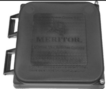
31083-28 Control Box Lid