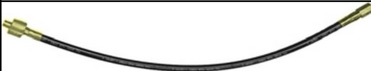
31373-00 Long Flex Hose