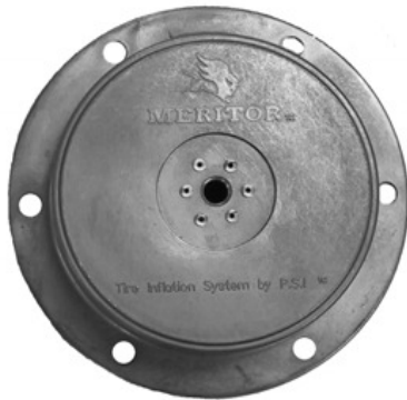
401-G Grease 6 Hole Hub Cap